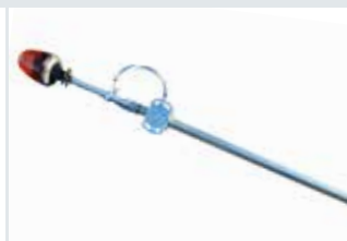
[ 3 ] Warning flasher