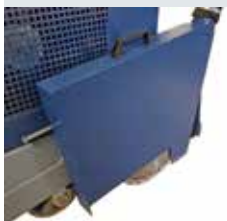
[ 1 ] Flush cutting blade guard