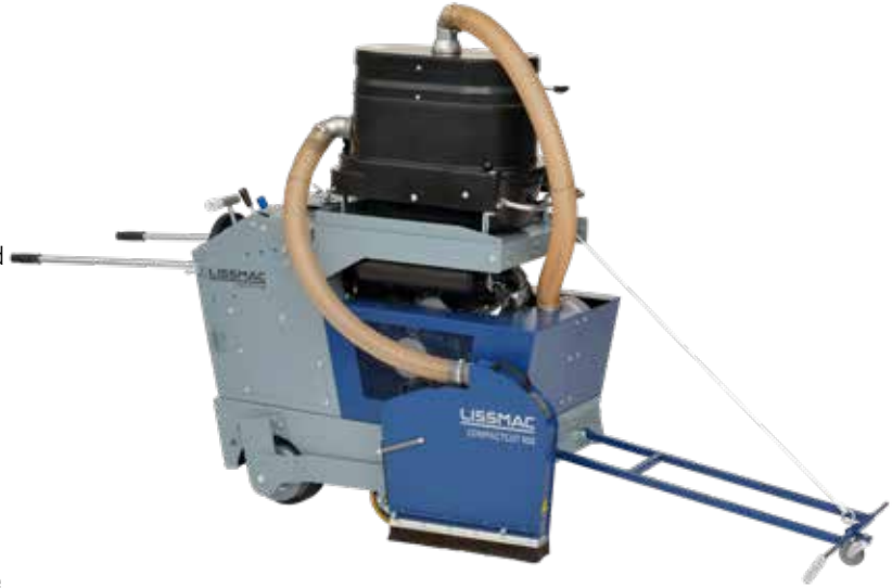
COMPACTCUT 900 P/T